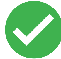
Exhibit elements in a new spot: