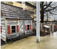
The Front Yard